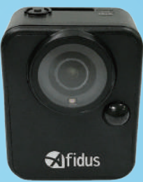
ATL-201S-PIR Sony Starvis™ Sensor F 0.95 IRIS f 4mm lens

※ The product design and dimensions may change without previous notice for improvement of performance. ※ AA size lithium battery or any battery voltage higher than 1.7 volts are not recommended.