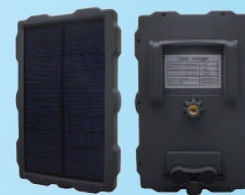
AT0002 Solar panel battery, for longer recording, outdoor use