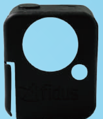
ATL-201S-PIR Silicone Sleeve