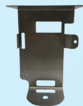
AT0001 Camera sunshield bracket, stainless 304, outdoor use.