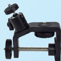
AM8218 C-Clip metal bracket