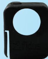
• Silicone Sleeve